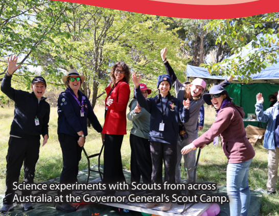
Science experiments with Scouts from across Australia at the Governor General's Scout Camp.

Lyneham Primary School and University of Canberra High School both recieved $250,000 and Malkara School recieved $320,000 for playground and accessibility upgrades as part of the Schools Upgrade Fund Round 2.