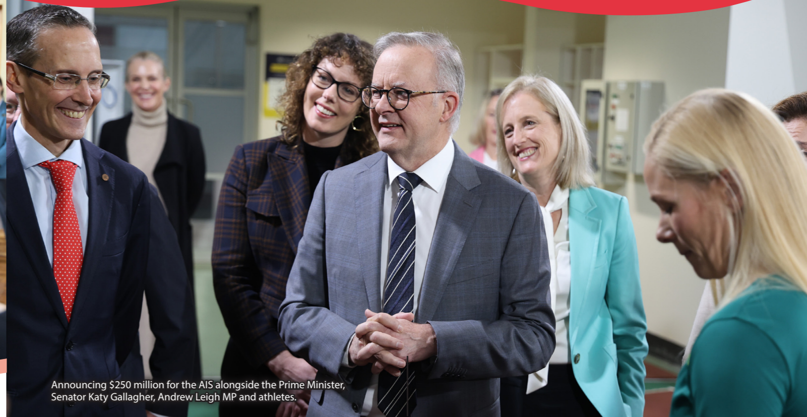
Announcing $250 million for the AIS alongside the Prime Minister, Senator Katy Gallagher, Andrew Leigh MP and athletes.