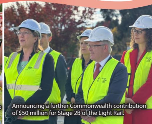
Announcing a further Commonwealth contribution of $50 million for Stage 2B of the Light Rail.