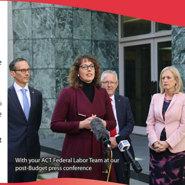
With your ACT Federal Labor Team at our post-Budget press conference

That's why we're reforming the tax system so you can keep more of what you earn.