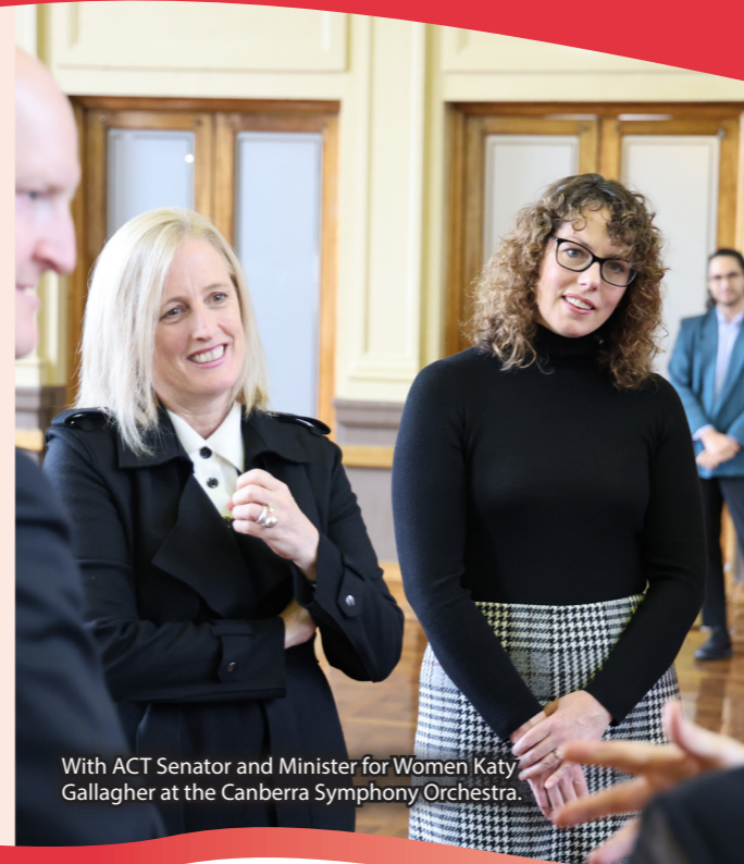
With ACT Senator and Minister for Women Katy Gallagher at the Canberra Symphony Orchestra.

Under Labor our world gender equality ranking has increased to 26th. This is as a direct result of our Government's commitment to gender representation in politics, and society. The gender pay gap has also dropped to 12%, its lowest level in history.