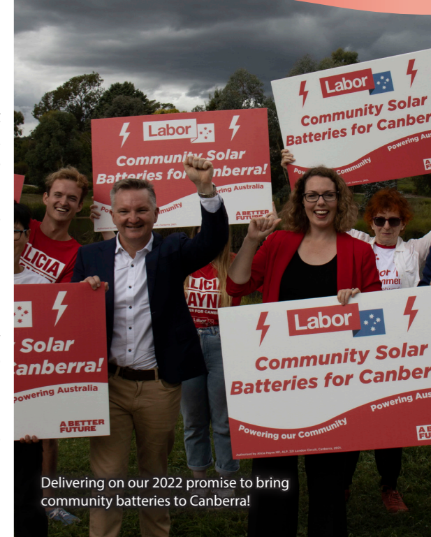
Delivering on our 2022 promise to bring community batteries to Canberra!

Labor's new vehicle emissions standards have also passed the Parliament. These changes ensure that you will have more options available when purchasing electric vehicles, and better fuel efficiency on new petrol cars coming into Australia.